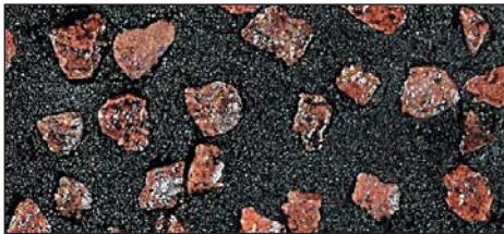
11/16mm Harden Red