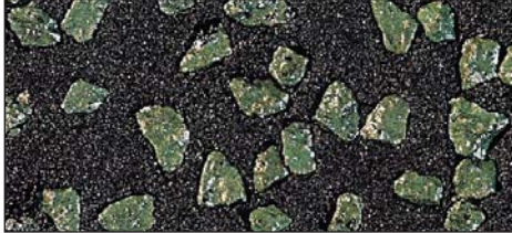
14mm Criggion Green (pigmented)

Colourchip® coated chippings are available in a wide range of standard natural aggregates with pigmented versions for even greater colour enhancement, some of which are illustrated below: